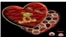
Box of chocolates