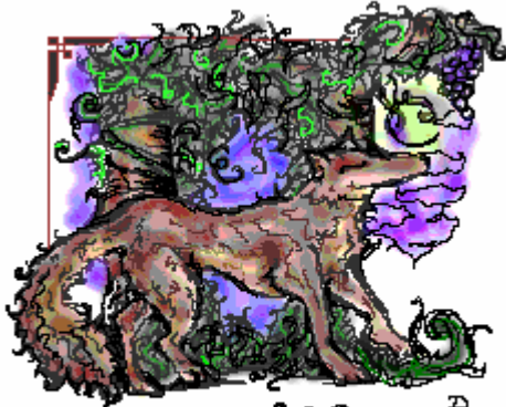
The Fox and the Grapes

One afternoon a fox was walking through the forest and spotted a bunch of grapes hanging from over a lofty branch.